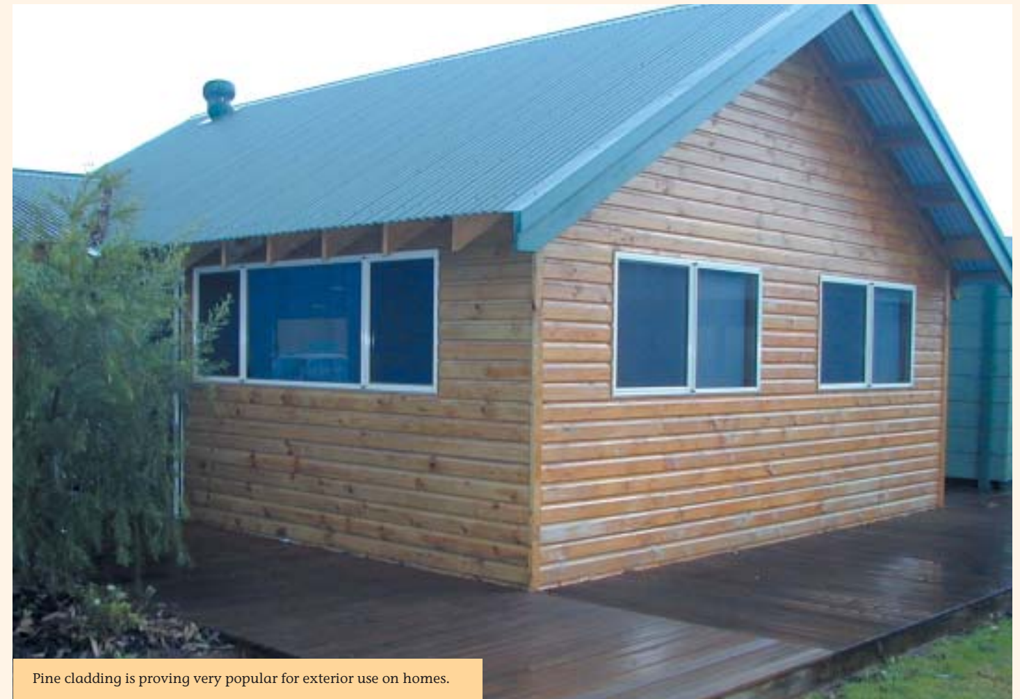
Pine cladding is proving very popular for exterior use on homes.