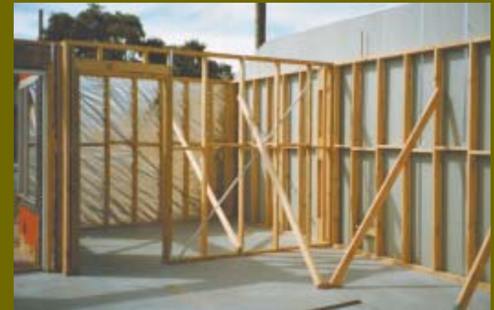
WESPINE timber is an integral component of the innovative BORAL PartiWALL system used in the construction of the RAAF Retirement Village in Albany.

Although the retirement village was originally specified with double cavity double brick walls, it was an on-site